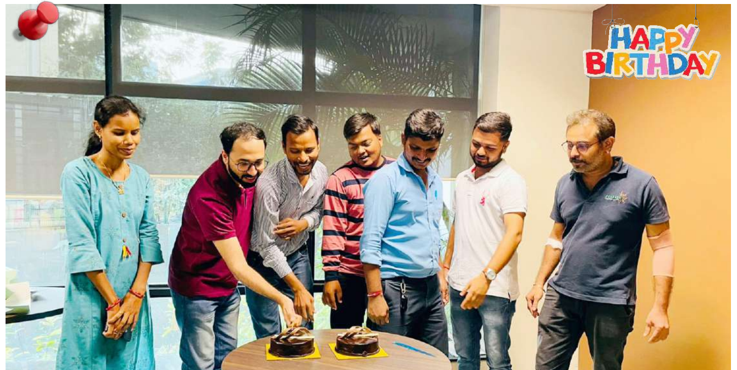
Monthly B'day Celebration - Oct - Nov 2022