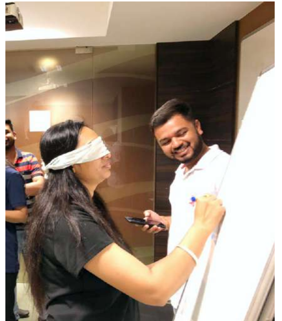
Fun Friday with PCAPL Team